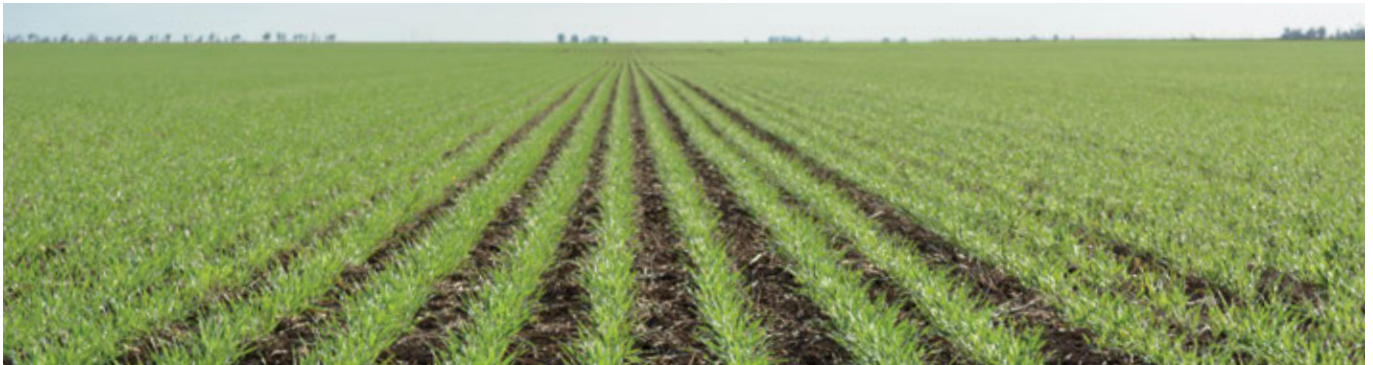
2015 La Trobe ® barley