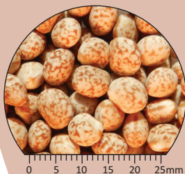
PBA Leeman Ⓛ

Source: Seed weight data is average of 3 sites in WA 2014–16; Protein and alkaloid is per cent As Received on whole seed basis from multiple sites in 2010–2015 (chemical analyses by ChemCentre, Bentley, WA).