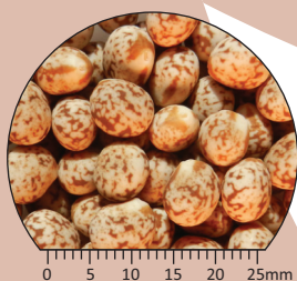
PBA Barlock Ⓛ